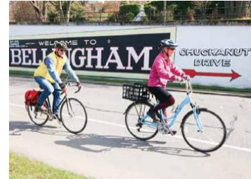
Bicycle Master Plan