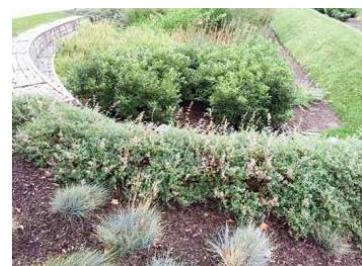
Bioretention and native plants

For additional examples and guidance, reference the APWA Center for Sustainability's (C4S) Sustainable Practices in Public Works report at C4S_SustainabilityPracticesInPublicWorks_small.pdf (apwa.net) .