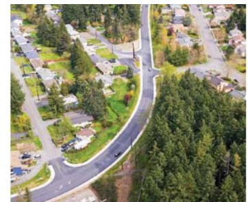
Warm mix asphalt and in-place recycling